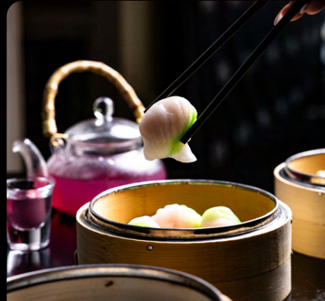
[S01] Jadeite Prawn Hargow (4 pcs) $10.90