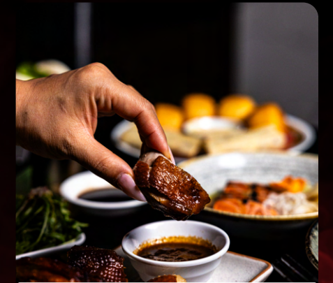
[BBQ04] Mala Roast Duck $19.90