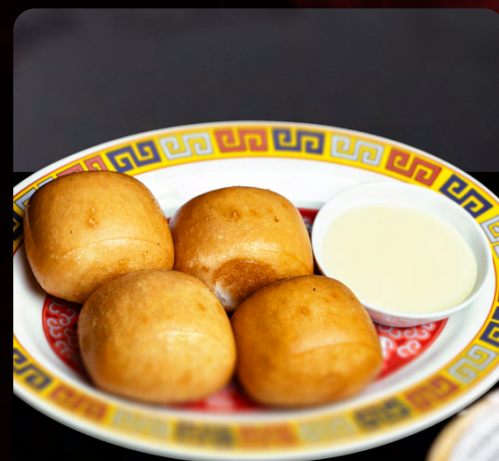
[F08] Fried Mantou (4 pcs) $9.90