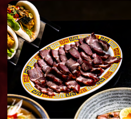
[BBQ02] Honey Glazed BBQ Pork $19.90