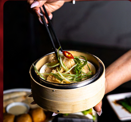
[S11] Beef Tripe $10.90