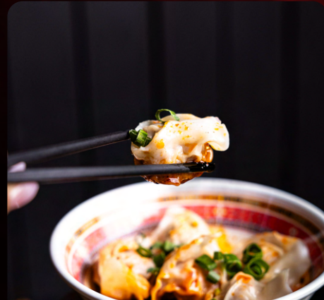
[S08] Spicy Prawn & Pork Dumplings (6 pcs) $14.90