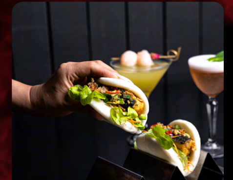
[BB02] Crispy Chicken Bao (2 pcs) $13.90